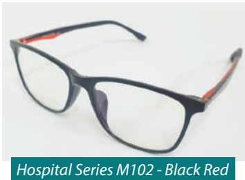
Hospital Series M102 - Black Red