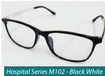
Hospital Series M102 - Black White