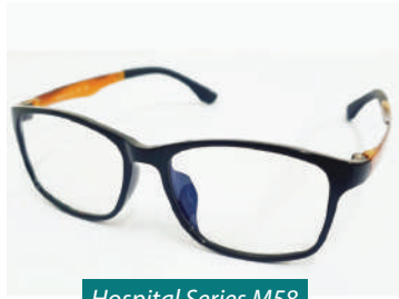
Hospital Series M58