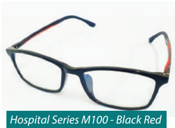
Hospital Series M100 - Black Red