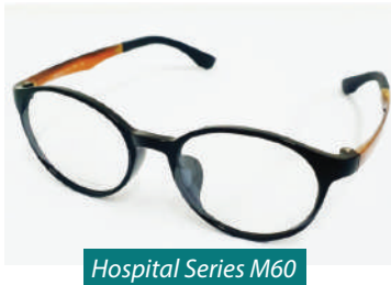
Hospital Series M60