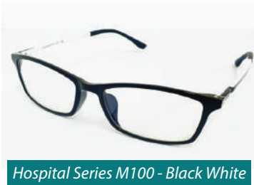
Hospital Series M100 - Black White