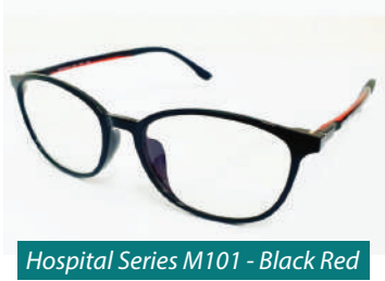
Hospital Series M101 - Black Red