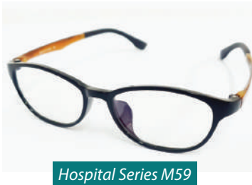
Hospital Series M59