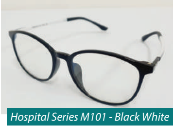
Hospital Series M101 - Black White