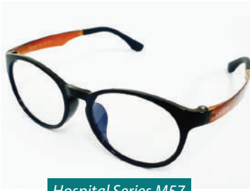
Hospital Series M57