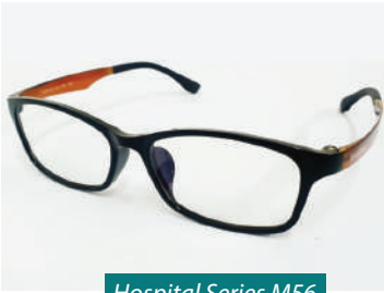
Hospital Series M56