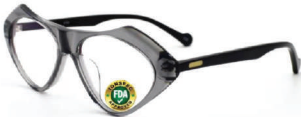
Model: 308 COL 02 Size: 53-15-145