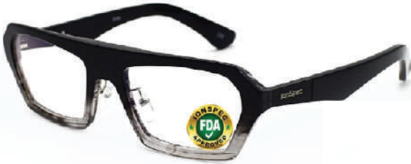
Model: 309 COL 01 Size: 55-19-140