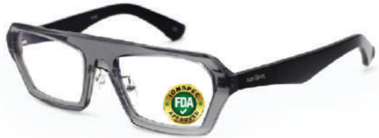
Model: 309 COL 02 Size: 55-19-140