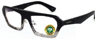
Model: 309 COL 01 Size: 55-19-140