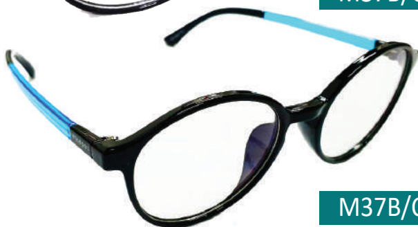
M37B/C - Black Blue