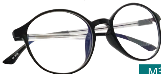
M37B/C - Black Trans