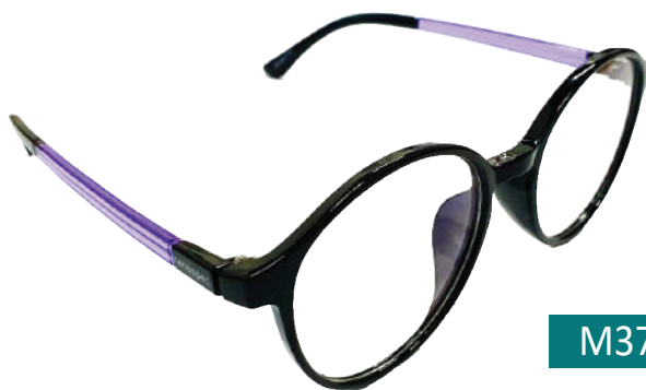
M37B/C - Black Purple