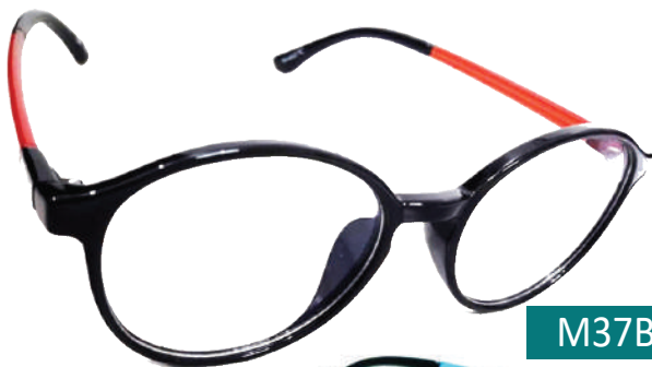
M37B/C - Black Red