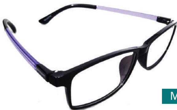
M38B/C - Black Purple