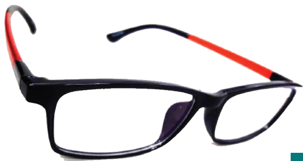
M38B/C - Black Red