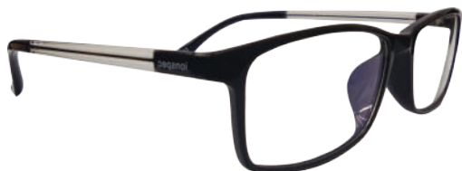
M38B/C - Black Transparent