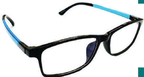
M38B/C - Black Blue