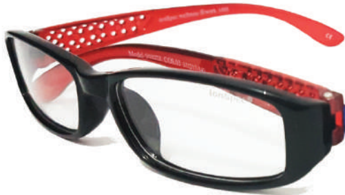
M9002 - Black Red