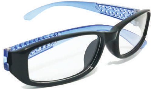
M9002 - Black Blue

IonSpec M9002 medical glasses from MGI are equipped with a Germanium Stone attribute, Far Infrared (FIR), Nano Silver, tourmaline stone, and also Negative Ion embedded in its temples and frames through nanotechnology from Germany making it the only glasses with medical functions in the world. It is made of an elastic and light material with fascinating shapes and colors making these medical glasses FAVORITE for many people since they are suitable for various ages, facial shapes, genders, and other aspects.