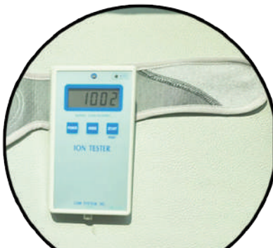
Negative Ion Test (EAR SIDE)