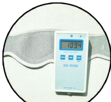
Negative Ion Test (EYE SIDE)