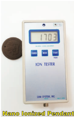
Nano Ionized Pendant