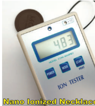
Nano Ionized Necklace